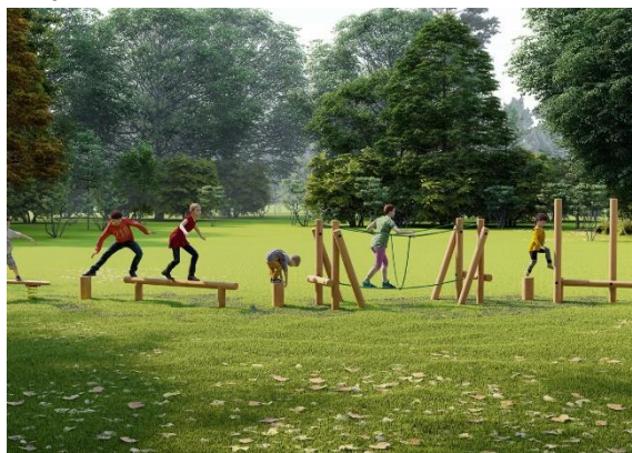
Adult Rower Outdoor Gym Equipment and Children's Country Trail