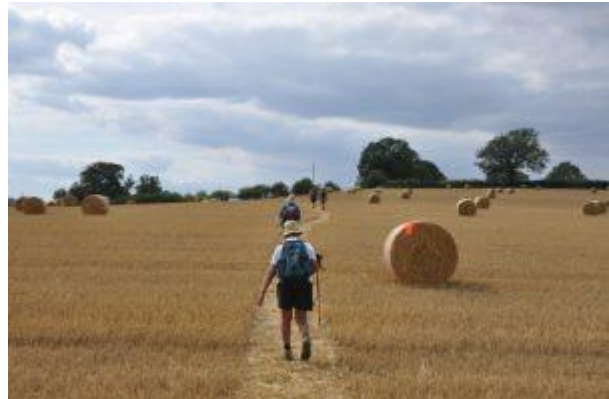
A local footpath heading towards the village